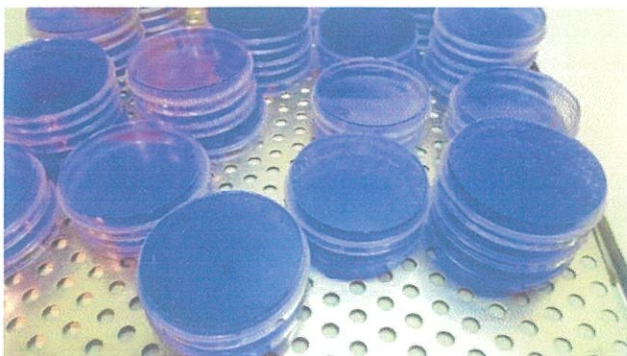
Figure 2. Quantification of infectious CBV5 by PFU in BGM cells